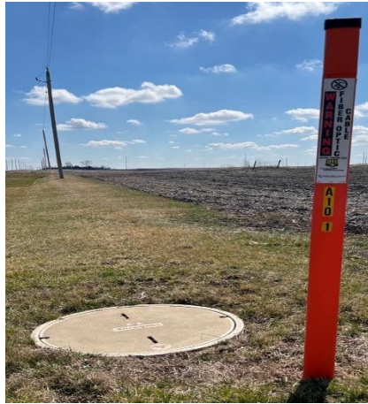
Before and after photos of a locate post due a ditch being burnt.